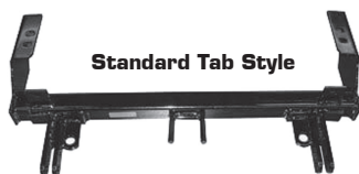
Standard Tab Style